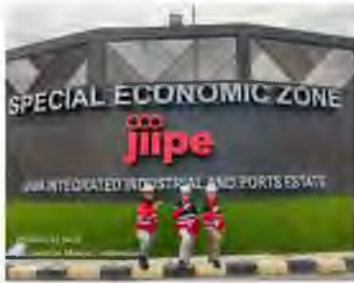
Safety Teamwork -JIIFE