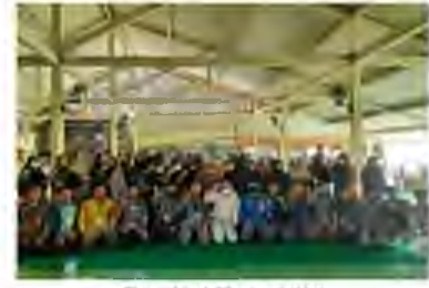
Dunia K3 at UIN