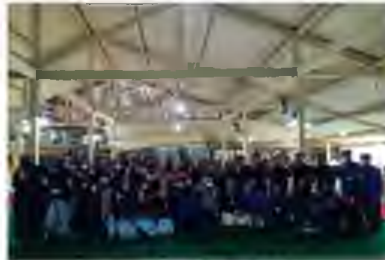
Dunia K3 at UIN