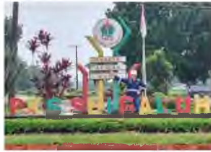
PKS Sei Galuh