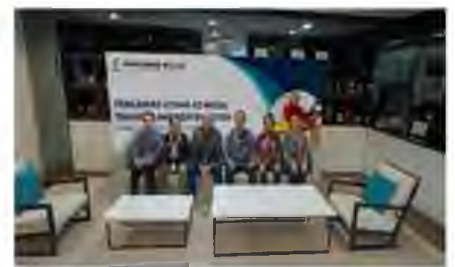
HSE Taining at Petronas