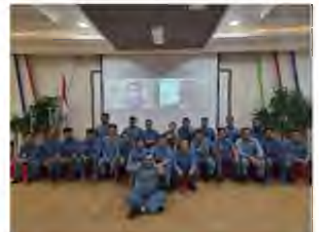
Online HSE Training at Inalum