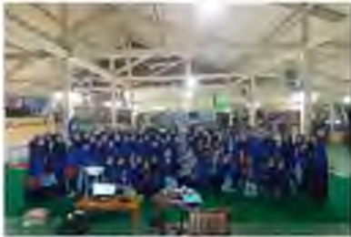
Dunia K3 at UIN