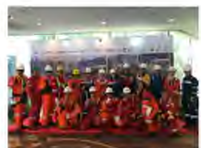
SKK Migas meeting - BP