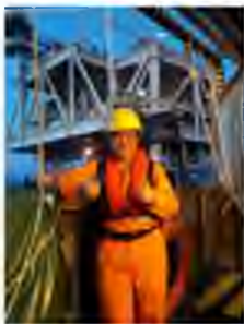
VRA Pigging - BP