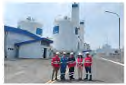
Customer visit – Linde JIIFE