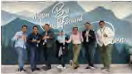
Bulan K3 Nasional at Star Energy Geothermal