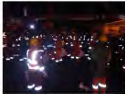
TBT Shift Malam - BP