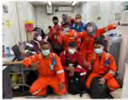
TAR 11 at BP