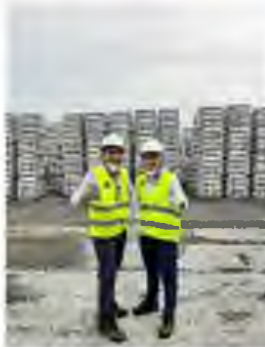
Safety Observation at Inalum