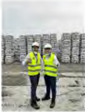
Safety Observation at Inalum