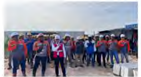
Contractor Tool Box Meeting- JIIFE