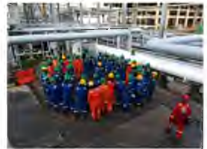
Tool Box Talk - BP