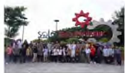
Trainer Risk Assessment di OGSCI Solo Techno Park