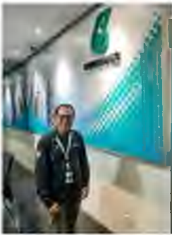
HSE Taining at Petronas