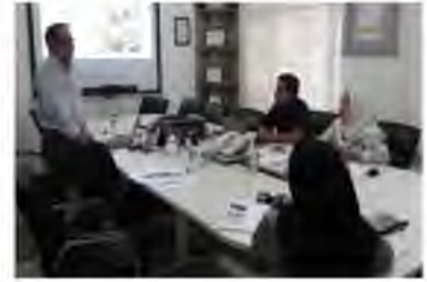
Auditee Training at FT