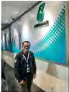
HSE Taining at Petronas