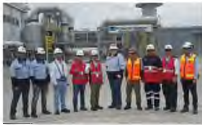
Customer visit – Erenport JIIFE