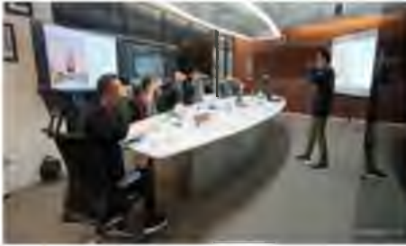
HSE Taining at Petronas