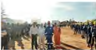
Project Join Safety Meeting-Meindo