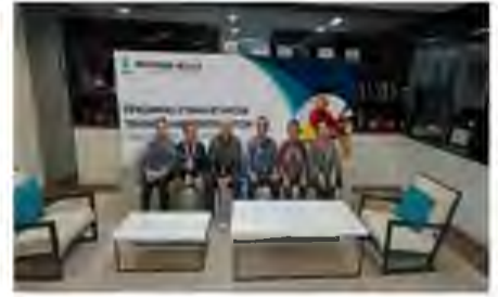
HSE Taining at Petronas