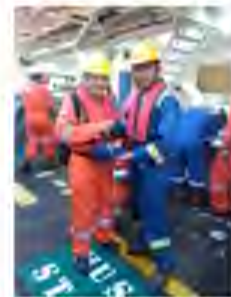
VRA Pigging Award