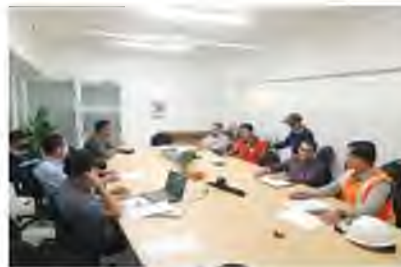
Shopee Elevator Audit Preparation