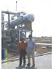
EPC LPG Plant Cemara - Presson