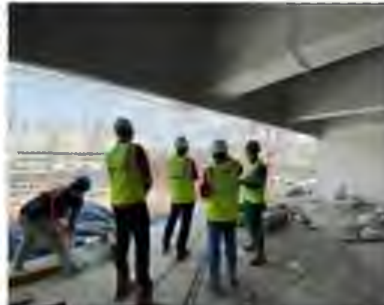
Safety Observation at JIS