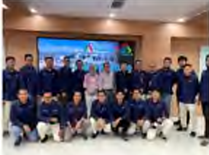
HSE Training and Safety Culture Sharing at Inalum