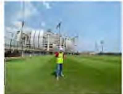
Safety Observation at JIS