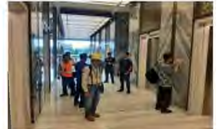
Shopee Elevator Audit