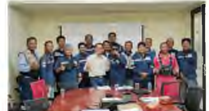
Leadership Safety Training-Meindo