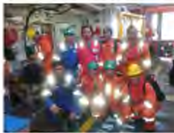
VRA Pigging HSE Team