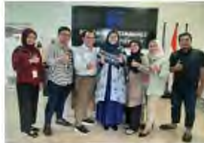
CSMS Training at FT