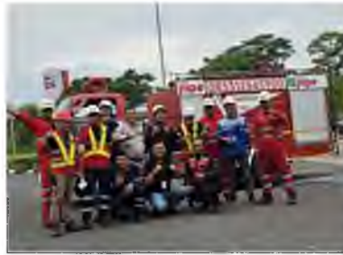
Earthquake Emergency Drill-JIIFE