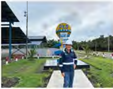
PKS Sei Buatan