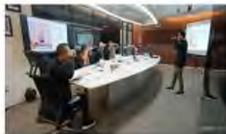
HSE Taining at Petronas