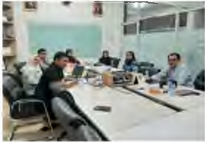
CSMS Training at FT