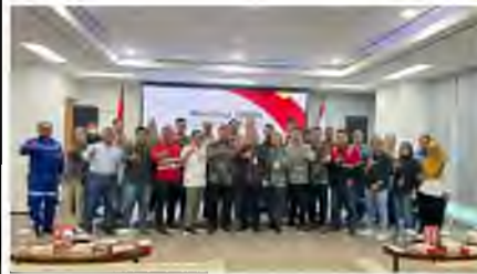
HSE Rep Coordination - JIIFE