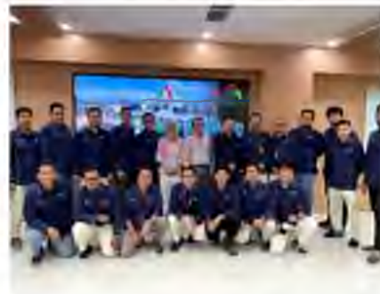
HSE Training and Safety Culture Sharing at Inalum