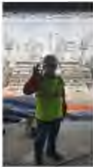
Safety Observation at JIS