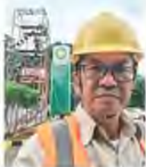
Pole Sign Installation-AKR