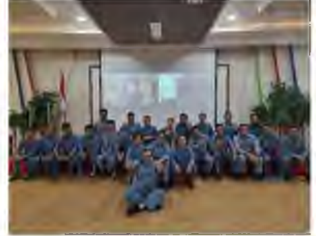
Online HSE Training at Inalum