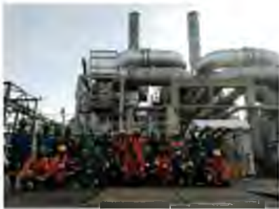
TAR 9 - BP