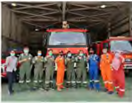
TAR 10 at BP