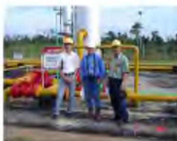
Revamp Gas Gatering - Presson