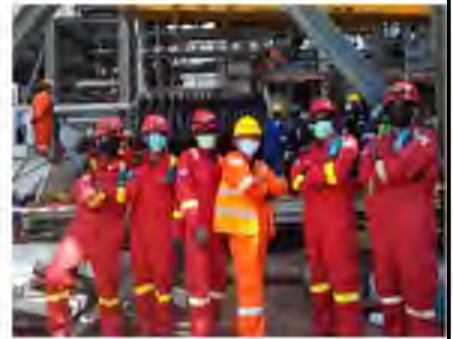
TAR 11 at BP