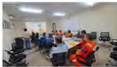
Presentation Safety Culture-Meindo